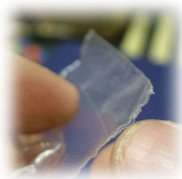
No Rippler Poor aesthetic, prone to resealing issues

It can be a frustrating experience for a consumer to open an easy peel package that has resealed itself.