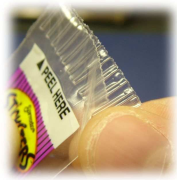
MDC Easy Peel Rippler Best aesthetic, reliable opening

Our system is custom made for each model machine and self contained requiring 220v, 30psi of air and a dry contact for activation, the system can run up to 25CPM and can ripple 2 rows back to back. This is the most cost effective system as it does not require any tooling modifications.